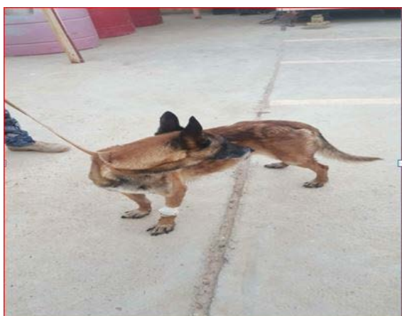
Figure 5: Slight Improvement of the Dog after 2-3 Days.