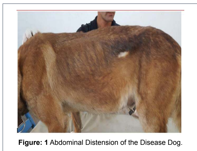
Figure 1: Abdominal Distension of the Disease Dog.

Vital signs of the dog, (Table 1) show that, Body temperature is 38.4 C. Heart rate of 105/ min, respiratory rate 37/ min. Capillary refill time is 5/Sec. (Table 1). Blood was collected for a complete blood analysis (On an automatic full digital cell counter, Beckman, USA) and the results are shown in (Table 2). Since