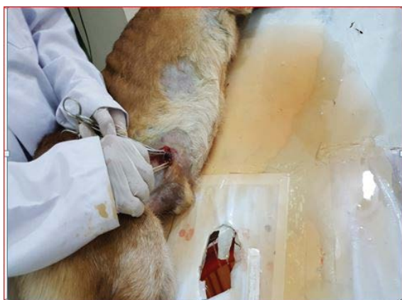
Figure 4: Evacuation of the Abdominal Fluid via Laboratory.

The clinical manifestations beside the hematological and biochemical results of the present case were agreed with others [5, 8, 11]. It had been mentioned that in many animals