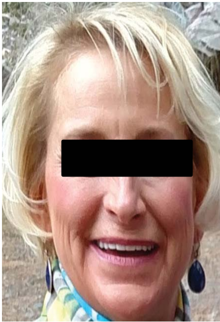
Figure 4: Resolution of facial swelling following hyaluronidase injections.

In the era of evidenced-based practice and technological advances, taking a proper medical history often has been underrated in its efficacy in the diagnostic process. This idea continues to be contrasted with the traditional method of thorough history taking, physical examination, and clinical reasoning about what tests, if any, are needed to reach a proper diagnosis. The later tradition in medicine may take somewhat longer, but remains a cornerstone of clinical practice. [2, 3] In this current scenario, knowledge of the dermal fillers and Botox injections was not ascertained in history-taking from each of the healthcare providers that examined the patient. The patient's history of treatment by a plastic surgeon, one year prior to the onset of facial edema, remained unknown. A further obstacle to obtaining a proper diagnosis in this case could be the lack of a common medical record. If each Medical Record contains sufficient, accurate information that could be used to support a diagnosis and justify treatment, patient outcomes would promote continuity of care among health care providers. [4] In this particular case, the previous treatment